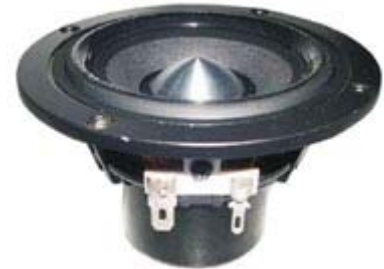
3" PAPER FULL RANGE