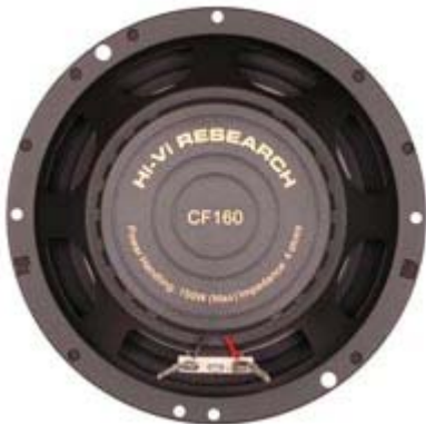
CF160 Bottom View (Magnify)