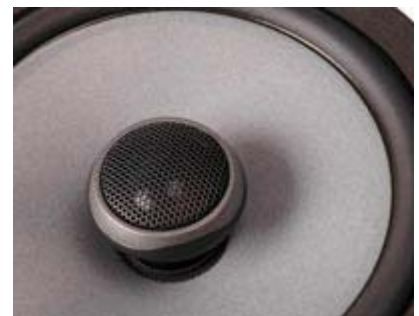
CF160 Part View 2 (Magnify)