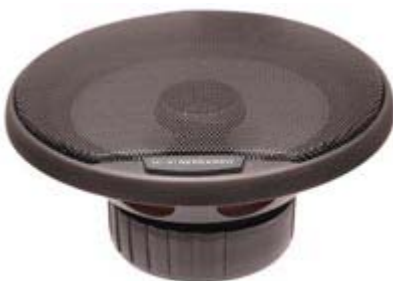
CF160 Side View (Magnify)