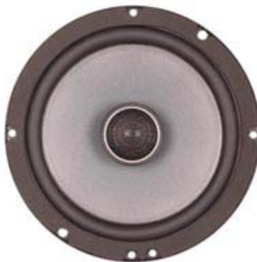
Top View (No Protection grill) (Magnify)