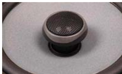
CF160 Part View 1 (Magnify)