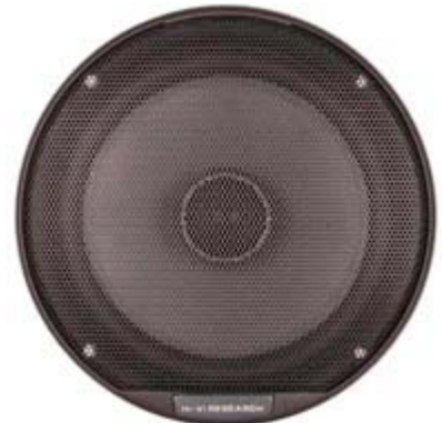
CF160 Top View (Magnify)