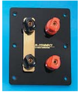
M-Connect 122 Bi-Wire Kit With 6mm Pure Copper Posts