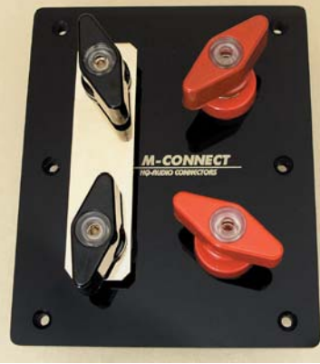
M-Connect 150 Bi-wire Kit Available with Pure Copper or Brass 8mm Binding Posts