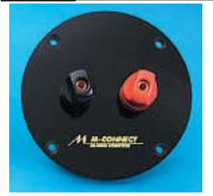
M-Connect 105 Kit With 6mm Pure Copper Posts