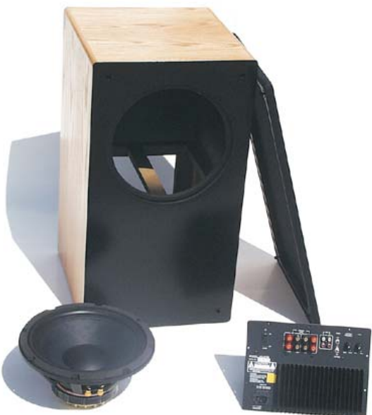
18" deep x 28.25" high x 15.5" wide

SC12 Price Each $480.00 (w/o cabinet $285.00)