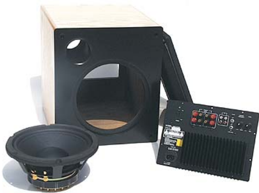
18" deep x 16" tall x 14" wide

Price Each $393.00 (w/o cabinet $253.00)